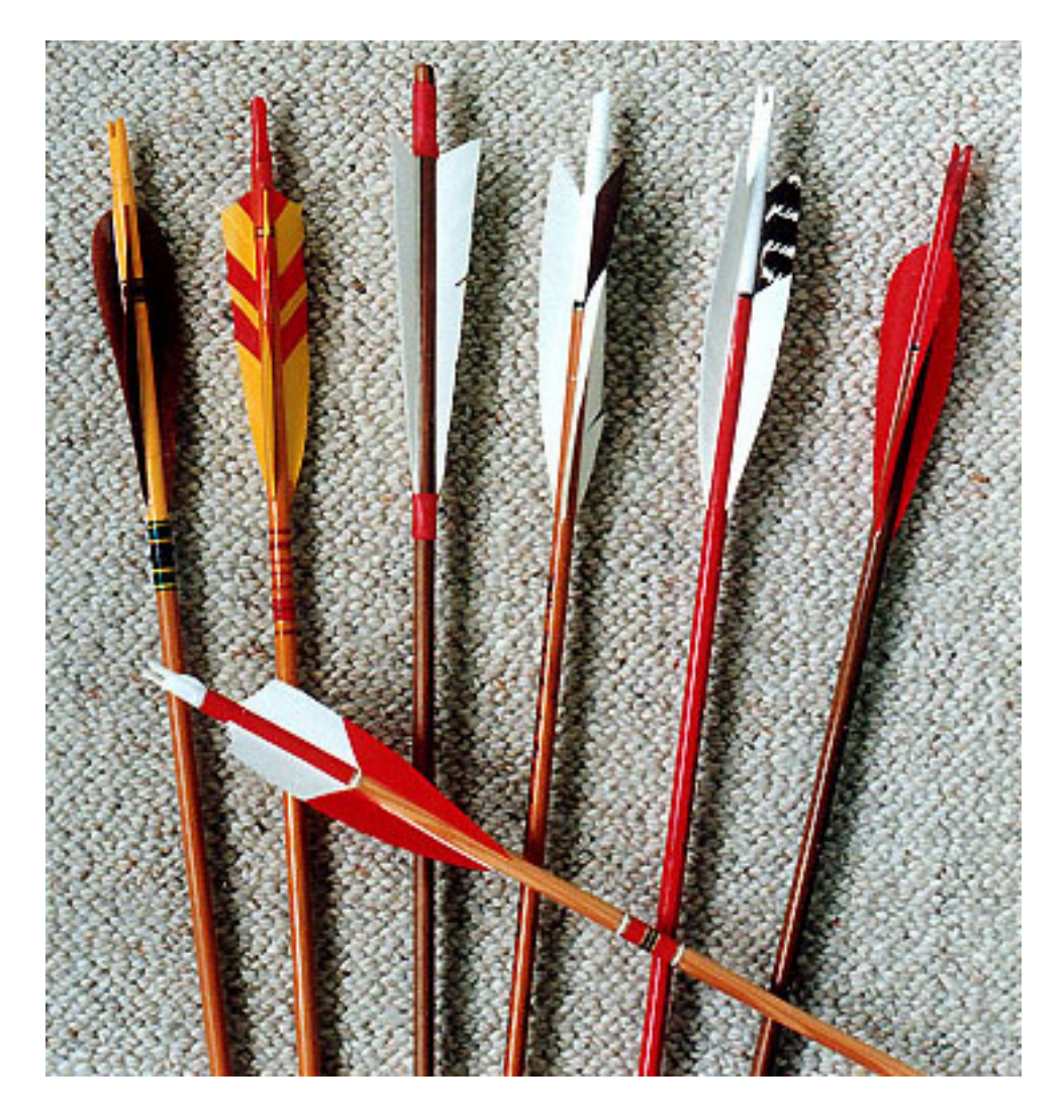
The Finished Product: A Purposeful Work of Art!

Well there you are a matched set of wood arrows. These are special arrows because you made them yourself. You can't buy them like this from any archery supply shop. I always feel a sense of achievement at this time and you should feel proud of your efforts as well. Now go and use them for what they were made for, shooting from your favourite bow.